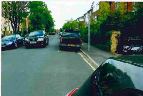
CROSSOVER AT 24 ←

CAR E055 VPA STILL UNABLE TO PROCEED - WITH PROPOSED PAVEMENT EXTENSION THERE WILL BE CONGESTION MOST OF THE DAY. THIS IS ONE OF THE WIDER ROADS IN MERTON.