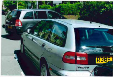
ATTEMPTING ENTRY/EXIT 22 SOUTHEY RD CROSSOVER.