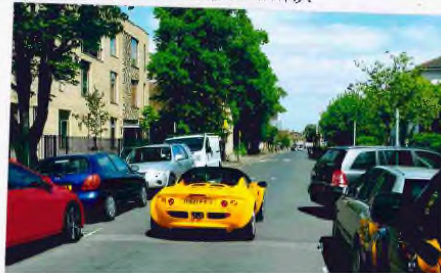
CROSSOVER ENTRANCE ← TO 22 SOUTHEY RD.